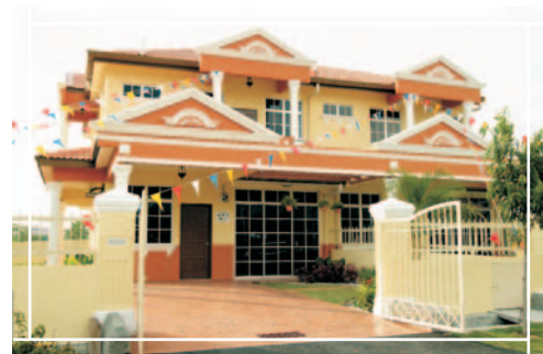
Desa Indah - Showhouse