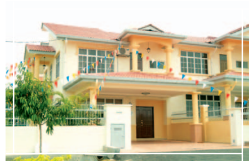
Desa Kolej - Showhouse

The launching of the 'Nilai 1' wholesale centre in August 2004 has stimulated business activity in Putra Nilai and will create further demand for both residential and commercial properties.